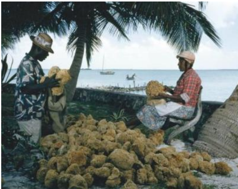
Sponge farmers trim the harvest for shipment, Andros Island, Bahamas

Corals can be killed by physical contact with anchors, fishing nets, boat hulls and even people's feet. This is certainly an issue in the coastal waters around the Bahamas, where thousands of divers, fishermen and sightseers are attracted every year. Although the harvesting of sponges is an important local industry in the Bahamas (its origins stretch back to the 1840s when Greek divers first exploited the reef for its sponges), it can create a harmful imbalance in the ecosystem.